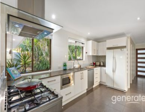
42 Flowers Road, Caboolture, QLD